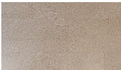
Coyote Canyon 0205