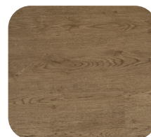
Ochre Point 0203