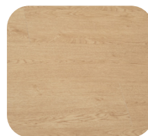
Palomino Prairie 0102