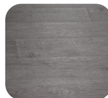
Stormy Port 0301