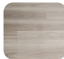
Doe Mountain 0103