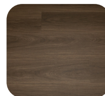
Bonfire Oak 0205