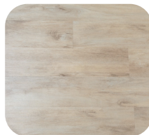
Chinook Avenue 0104