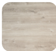
Mohegan Bluff 0101