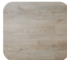
Arroyo Dune 0105